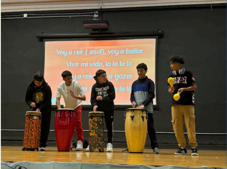
8th grade students perform the song, "Vivir mi vida"