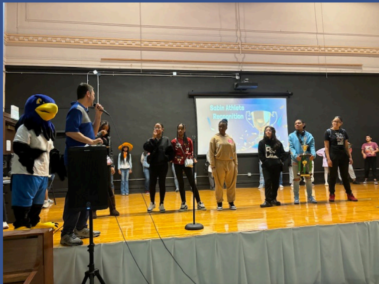
Sabin Athlete Recognition at the Spring Showcase